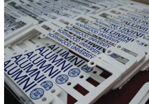
Alumni working for you.