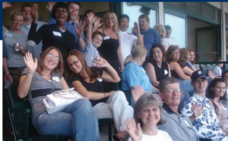
An Alumni ballgame event