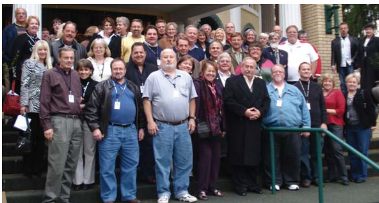
Indiana Campus Family and Friends