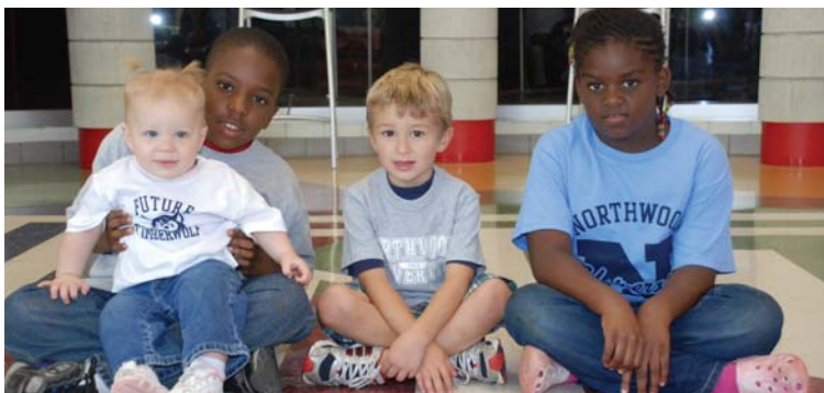
Developing FUTURE Leaders!