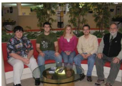
2008-09 Student Honors Association

The Student Honors Association plans on holding a student forum at least once a term to keep the students updated on what is going on within the honors program. Currently the SHA E-board is working hard on a proposal for an honors college. They are developing entrance requirements, course requirements, an organization budget, and much more. This group of students is basically working towards making history at Northwood and making it a successful honors college. They started the year with only four members and are happy to bring on two more. This is a big project for the SHA E-board and they could use extra minds to put a great program together. If you have any questions or would like to find a way to get involved then please keep your eye out for upcoming events on Blackboard.