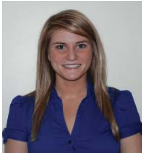
Allison Piper, Contributing Writer

Story by: Allison Piper, Contributing Writer